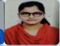
Muskanaliya Varavi 71.36%