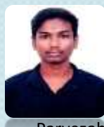
Parvezahm ed Uppar 70.47%